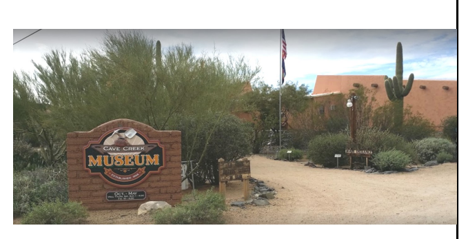
6140 Skyline Drive • Cave Creek, Arizona

Non Profit Org. U.S. Postage PAID Cave Creek, AZ 85331 Permit No. 7