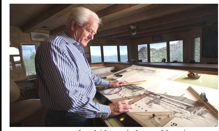
Loralei Lazurek, Images Magazine