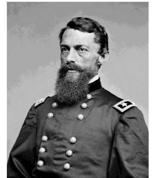
General George Stoneman Jr.