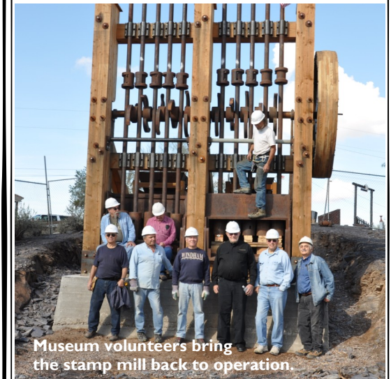
Museum volunteers bring the stamp mill back to operation.